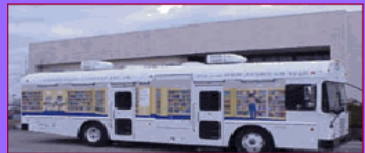
A state-of-the-art specialty vehicle mobile library offering both traditional and online library resources. (Washoe County, NV)