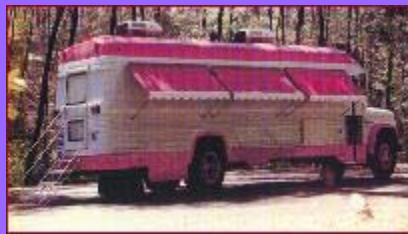
A children's caravan bookmobile (1960s). (Weston, CT).