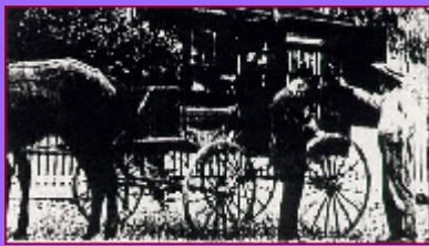
One of the first bookmobiles--A wagon drawn by a two horse team. (1905)

Mobile libraries have been in use for a long time. Before the motorized mobile libraries came into being, bicycles, horse-drawn wagons, donkey carts, were used to carry the library books to the reader. Today, motorbikes, boats, helicopters, trains, trucks, vans, and mini buses are used for this purpose. In Kenya, camel mobile libraries are still in operation. Donkeys are providing effective multi-media library services in Zimbabwe, according to the latest IFLA Professional Report. The mobile library brings the books to the reader all over the world.